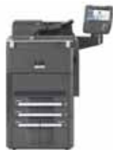
Shown with standard 270 sheet DSDP