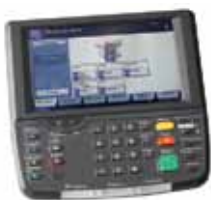
Newly designed, easy-to-use large color touch screen control panel