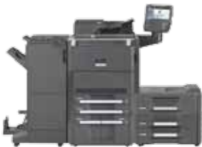
Shown with standard 270 sheet DSDP, optional 500 x 2 sheet paper trays, 500 sheet multi-purpose tray, and 4,000 sheet finisher