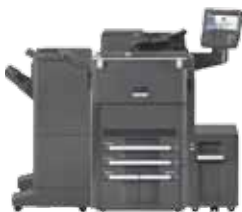
Shown with standard 270 sheet DSDP, optional 3,000 sheet side LCT and 4,000 sheet finisher