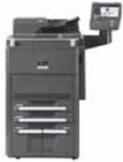
Shown with standard 270 sheet DSDP