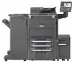
Shown with standard 270 sheet DSDP, optional 3,000 sheet side LCT and 4,000 sheet finisher