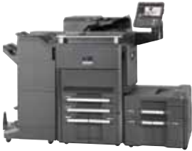
Shown with standard 270 sheet DSDP, optional 1,500 x 2 sheet trays, 500 sheet multi-purpose tray and 4,000 sheet finisher