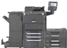
Shown with standard 270 sheet DSDP, optional 500 x 2 sheet paper trays, 500 sheet multi-purpose tray, and 4,000 sheet finisher