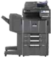
Shown with optional 175 sheet DSDP, optional 1,500 x 2 sheet trays, and a 1,000 sheet finisher