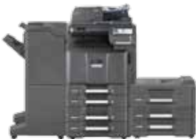
Shown with optional 175 sheet DSDP, 2 - 500 x 2 sheet paper trays, 500 sheet multi-purpose tray, and 4,000 sheet finisher