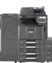
Shown with optional 175 sheet DSDP, 2 – 500 x 2 sheet paper trays, 500 sheet multi-purpose tray, and 4,000 sheet finisher