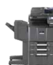
Shown with optional 175 sheet DSDP, optional 1,500 x 2 sheet trays, and 1,000 sheet finisher