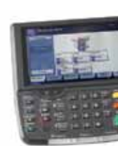
Newly designed, easy-to-use large color touch screen control panel