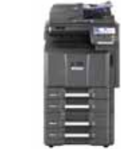
Shown with optional 175 sheet DSDP and 1,500 x 2 sheet paper trays