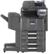
Shown with optional 175 sheet DSDP, 500 x 2 sheet paper trays and 1,000 sheet finisher