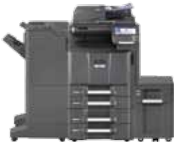
Shown with optional 175 sheet DSDP, 500 x 2 sheet paper trays, 3,000 sheet side LCT and 4,000 sheet finisher