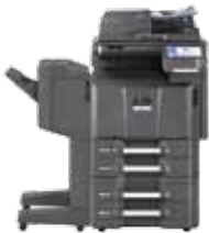
Shown with optional 175 sheet DSDP, 500 x 2 sheet paper trays and 1,000 sheet finisher