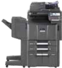
Shown with optional 175 sheet DSDP, 1,500 x 2 sheet paper trays and 1,000 sheet finisher