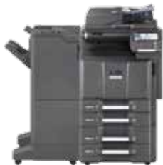
Shown with optional 175 sheet DSDP, 500 x 2 sheet paper trays and 4,000 sheet finisher