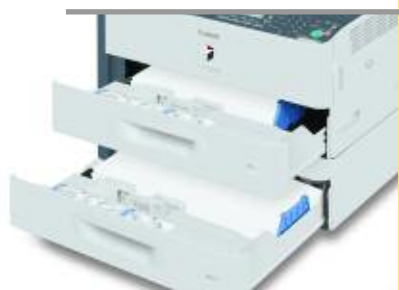
Expandable Paper Supply