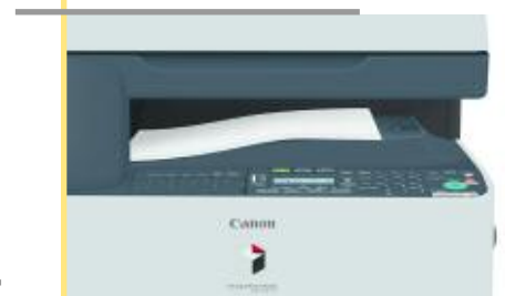
Integrated Output Tray

Plug-and-play connectivity is provided via a standard USB 2.0 high-speed interface for optimal performance. Best of all, each device can be fully networked so you can extend system capabilities to multiple users. (This is optional for the Canon imageRUNNER 1023 model).