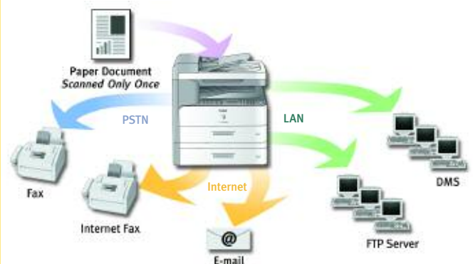
Document Distribution Technology