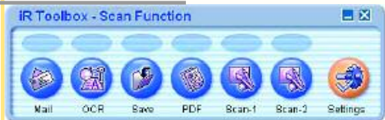
iR Toolbox Menu

The imageRUNNER 1023 Series devices are easy to manage and maintain as well. The embedded Department ID Mode tracks and limits system access to those users assigned valid IDs and passwords. In addition, device management utilities, including a browser-based Remote User Interface (UI), provide real-time monitoring and status information, while high-yielding supplies and consumables help keep operating costs to a minimum. Even more, as an ENERGY STAR® qualified system, the imageRUNNER 1023 Series devices are designed with the environment in mind.