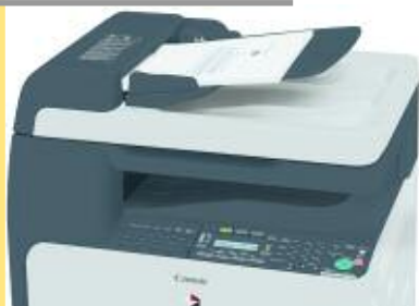
Duplexing Automatic Document Feeder